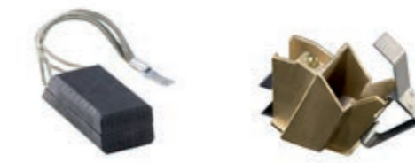
CARBON BRUSHES & BRUSH-HOLDERS FOR HOT ROLLING MILLS

Very large DC machines are used in this application; they are subject to difficult operating conditions: low or excessive humidity, repetitive operations. Your Mersen specialist will recommend to you the most suitable combination of brush-holders and carbon brushes.