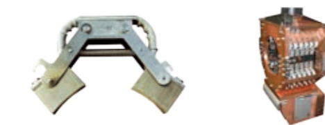
POWER TRANSMISSION SYSTEMS WITH CARBON BRUSHES & BRUSH-HOLDERS

This application takes place in an extremely corrosive atmosphere that impacts carbon brush life. Specifically designed for galvanic lines, Mersen's carbon brushes are manufactured with a high copper content to endure corrosion.